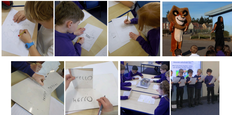
A selection of photos from our Year 3 blog on the school website showing some of our fantastic learning in Spring 1, including photos from World Book Week, including visits and live lessons with authors, science learning about light and reflection and script writing in English.

Do keep an eye on our Year 3 blog for updates on our learning too.