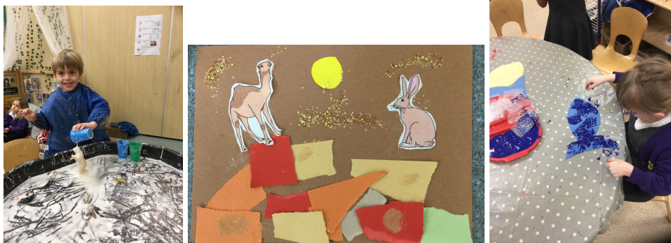
During the last half term we celebrated the lunar new year, valentine's day and we explored different habitats in the world.

Welcome back to all of our Reception pupils and their families! We hope that you had an enjoyable break and we look forward to working with you over the coming half term.