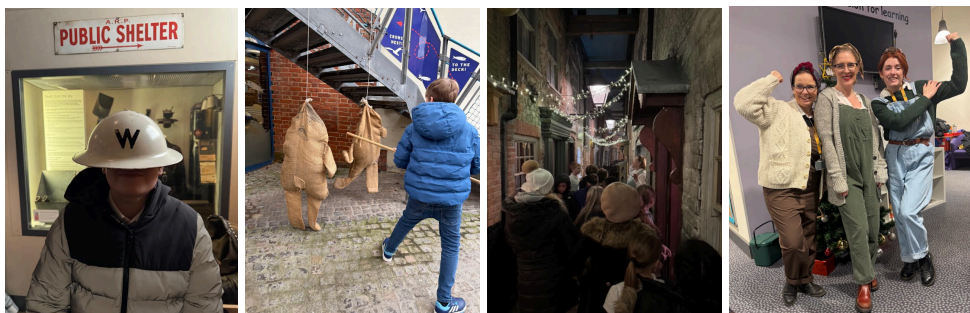
Year 6 enjoyed their visit to the Time and Tide Museum to celebrate their learning on WWII. Thank you to staff and volunteers for supporting the trip!