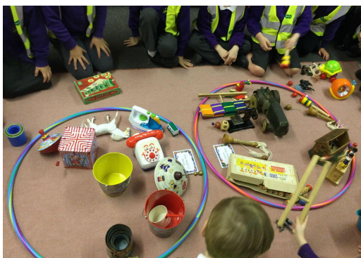
Year 1 on a school trip to Strangers' Hall.

Welcome back to all Year 1 families. We hope you had a restful break and look forward to working with you over the next term. We started last half term with a successful trip to Strangers' Hall. We also had a penguin break in! This led to some impressive writing of the 'Lost and Found' stories. The children worked so hard learning all the words and actions for their Christmas performance. We are so proud of them!