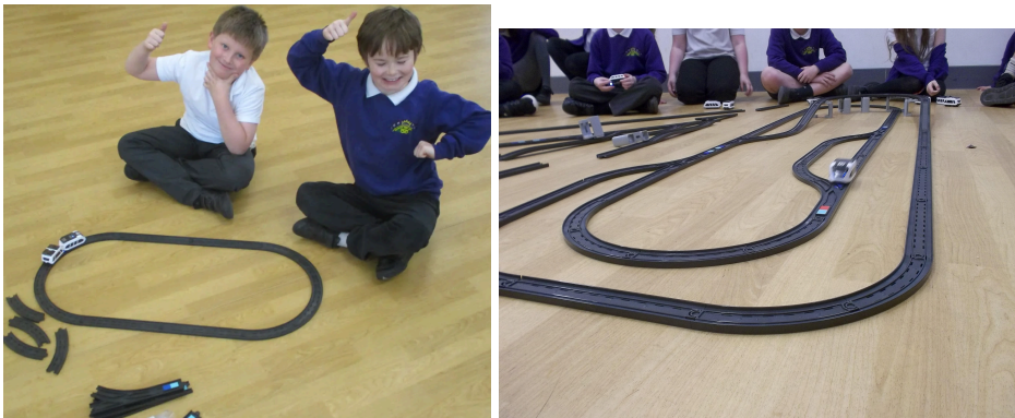
Recent pictures from our Greater Anglia Rail Intelino Workshop

We have had such a busy spring, it's hard to believe that we are already in the summer term. We ended our last term on a high. We were so proud of the children's behaviour and attitudes towards school life and their learning. The summer term is always such a busy and exciting one with school trips, residentials, Multiplication Times Table Check and so much more. Please take the time to read through this newsletter so that you are fully informed about everything that is coming up for Year 4 this half term.