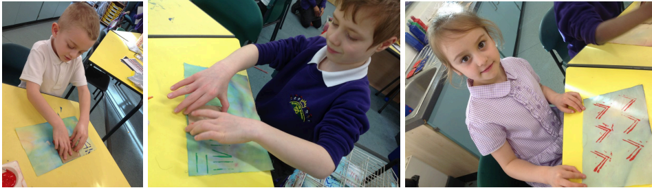
In art last half term, Year 2 pupils were learning about block printing. The children dip-dyed fabric before printing repeating patterns onto it using their own printing blocks.

Welcome back to all of our Year 2 pupils and their families! We hope that you had an enjoyable break and we look forward to working with you over the coming half term.