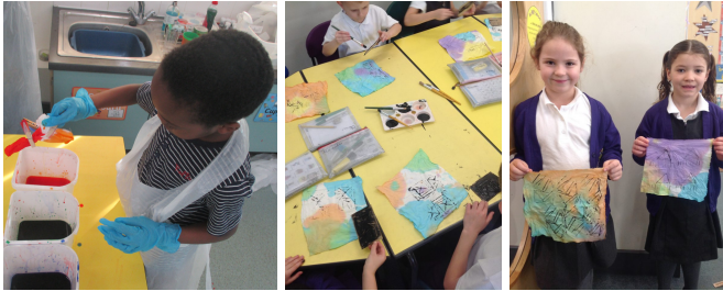
In art last half term, Year 2 were learning about Indian relief block printing. The children dip-dyed fabric before printing repeating patterns onto it using their own relief blocks.

Welcome back to all of our Year 2 pupils and their families! We hope that you had an enjoyable break and we look forward to working with you over the coming half term.