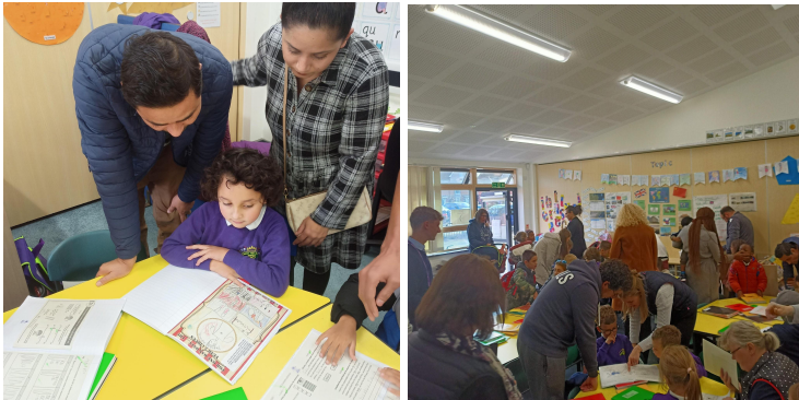
Photos from our recent workshare event, to which over 200 people attended.

Welcome back to all of our Year 2 pupils and their families! We hope that you had an enjoyable break over the half term and look forward to working with you over the coming terms. Please keep an eye out for any year group text messages as this is our main means of communicating with you all.