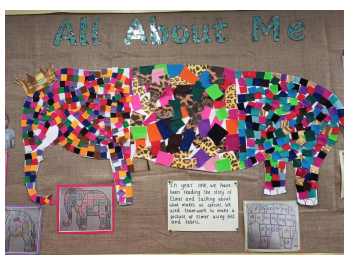
Year 1 Elmer Display