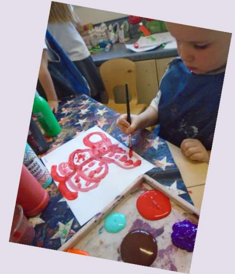
Expressive Arts and Design