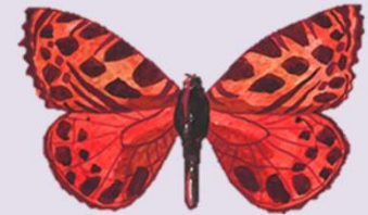
Les Papillons Rouges