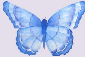
Les Papillons Bleus