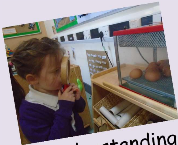
Understanding the World