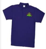
Purple polo shirt

We will let you know what days these are after October half term. From then on please send your child to school wearing their PE kit on those days.