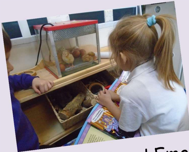
Personal, Social and Emotional Development