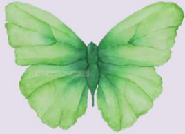
Les Papillons Verts