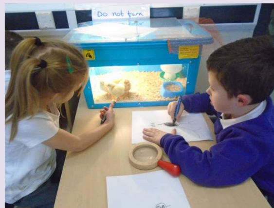
Communication and Language