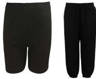
Black jogging bottoms, leggings or shorts