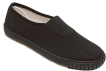
Trainers or plimsolls

If you would like to purchase via our school provider ' Birds of Dereham ' please visit their website or visit the store.