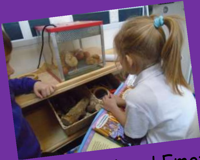
Personal, Social and Emotional Development