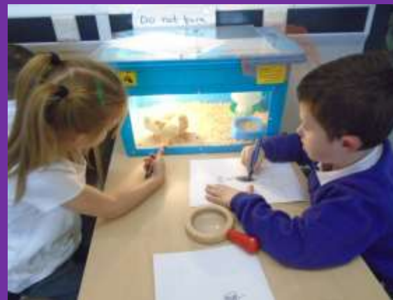
Communication and Language