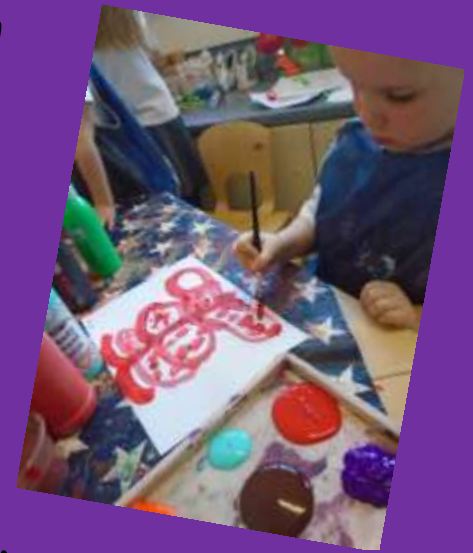
Expressive Arts and Design