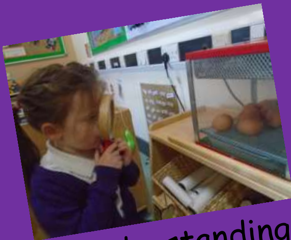
Understanding the World