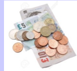
Adding and subtracting money.